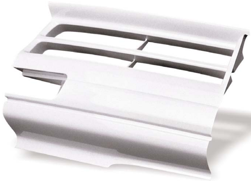
TPO Bumper Fascia

Polyolefin elastomers (or POEs) are a relatively new class of polymers that emerged with recent advances in metallocene polymerization catalysts. Representing one of the fastest growing synthetic polymers, POE's can be substituted for a number of generic polymers including ethylene propylene rubbers (EPR or EPDM), ethylene vinyl acetate (EVA), styrene-block copolymers (SBCs), and poly vinyl chloride (PVC). POEs are compatible with most olefinic materials, are an excellent impact modifier for plastics, and offer unique performance capabilities for compounded products. In less than a decade, POE's have emerged as a leading material for automotive exterior and interior applications (primarily in thermoplastic olefins [TPOs] via impact modification of polypropylene), wire and cable, extruded and molded goods, film applications, medical goods, adhesives, footwear, and foams.